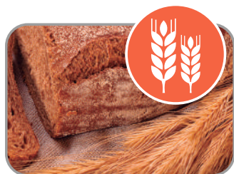
Cereals containing gluten (wheat, rye, barley, oats, spelt, kamut or their hybrid varieties) and derived products