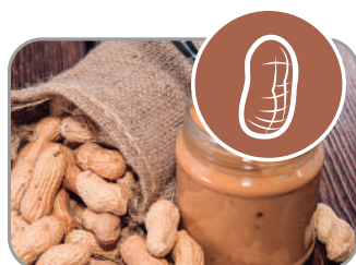
Peanuts and peanut-based products