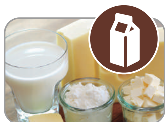
Milk and its derivatives including