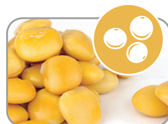
Lupins and products based on lupins