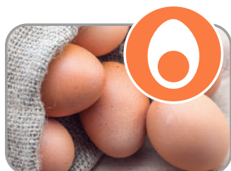
Eggs and egg-based products