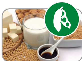
Soy and soy-based products