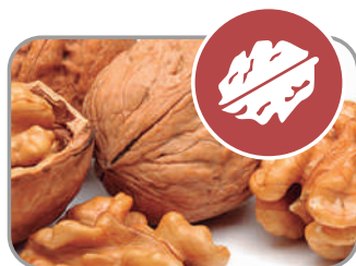
Nuts (almonds, hazelnuts, walnuts, cashews, pecans, Brazil nuts, pistachios, macadamia nuts or Australia nuts) and derived products