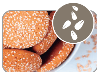
Sesame seeds and sesame-based products