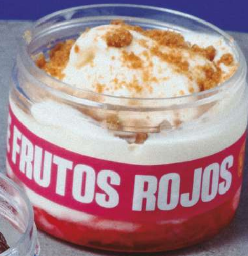
RED BERRIES CHEESECAKE